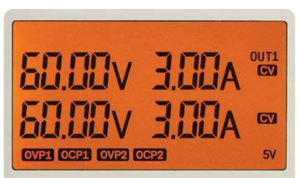
Figure 2. Backlight on/off feature with dual reading (voltage and current) on an LCD display